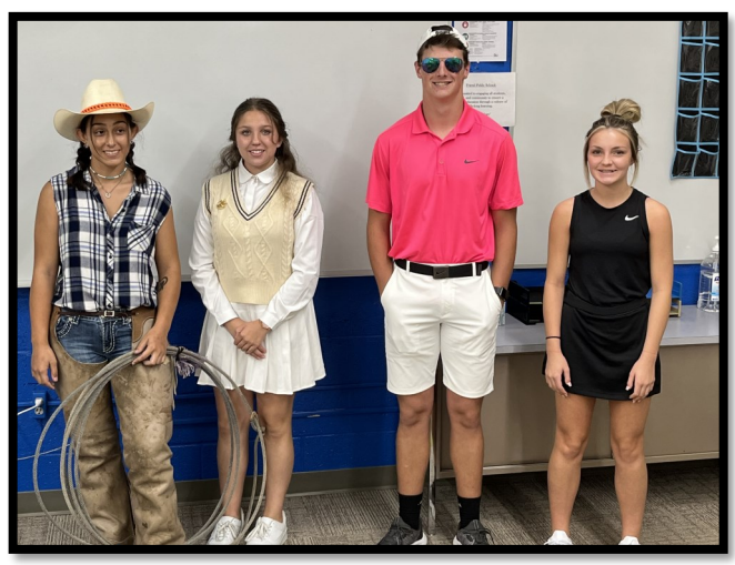
Country vs. Country Club!!