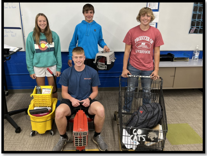
Anything but a backpack!!